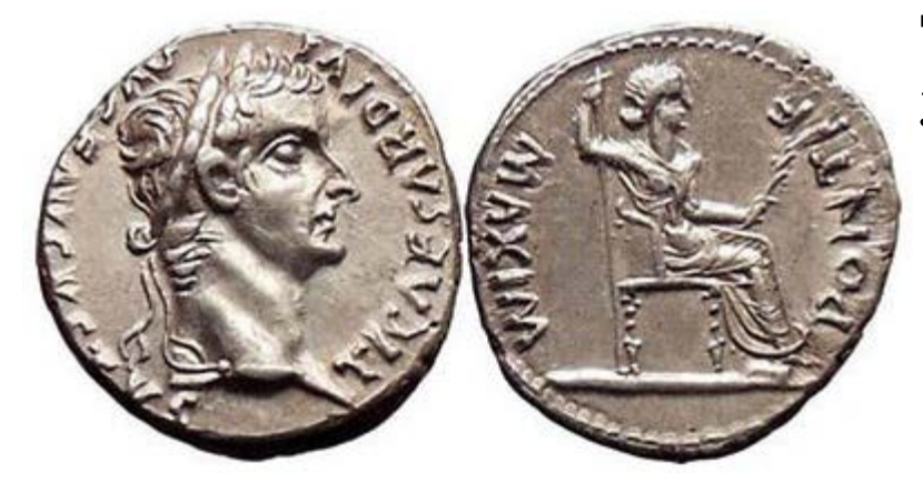
biblical coins of the nineteenth century.

Augustus - Roman Emperor: 27 B.C. - 14 A.D. Silver Denarius 19mm Rome mint: 2 B.C. - 2 A.D. CAESAR AVGVSTVS DIVI F. PATER PATRIAE, his laurel head right. C . L . CAESARES AVGVSTI F . COS . DESIG . PRINC . IVVENT., Caius and Lucius Caesars standing facing, shields and spears between them; above, between the spears, simpulum and lituus turned inwards.