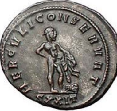
club with lion skin on rock