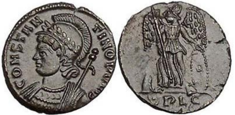
Roman capital by Constantine I the Great.

By circa 330 A.D., Constantine the Great completed his new capital for the Roman empire called Constantinople. For this momentous occasion, he issued two commemorative coin types, one celebrating Rome and the other Constantinople. The type that commemorated Rome had the personification of Rome, Roma with the inscription VRBS ROMA and the founders of Rome, Romulus and Remus on the reverse suckling the shewolf. The type that commemorated Constantinople had the personification of Constantinople on the obverse and Victory on a galley sailing with a shield. This was a great way for Constantine the Great to pay homage to both Rome and Constantinople.