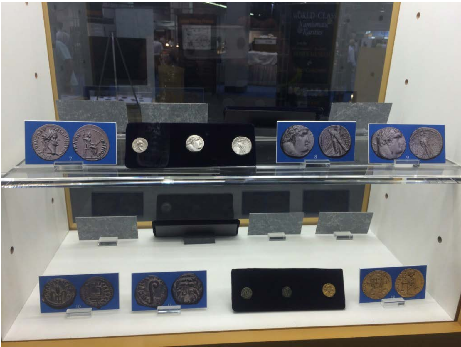
Display of the famous biblical "Tribute Penny" of emperor Tiberius, the Shekel of Tyre known as the 30 Pieces of Silver Judas betrayed Jesus for, Pontius Pilate the Roman ruler whom Christ was crucified under and the first Byzantine gold coin featuring Jesus Christ.