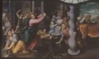
Scarsellino's 16th century painting, "Driving the Merchants from the Temple"

The Gospel of Matthew chapter 21 relates the outrage of Jesus that moneychangers were set up in the temple courtyard to exchange pilgrims' money for a fee. The temple would only accept half shekels and shekels of Tyre, coinage that was not considered blasphemous. Since each Jewish male owed a temple tax of a half shekel per year and many did not live in areas where shekels of Tyre circulated, the exchange business was profitable.